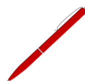
Pen that isn't blue or black